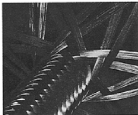
Equal tensioning of individual wires ensures uniform distribution of forces.